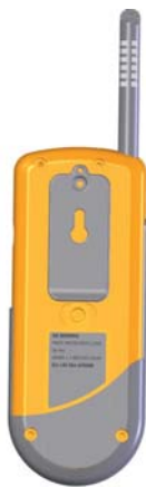
Rear view of the Psychone shows a convenient belt clip and wall hanging mount