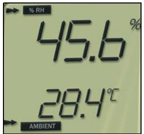
Figure 3: Typical Screen Display During Operation